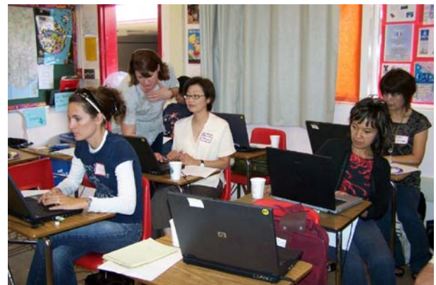
FLAGS PowerPoint Conference