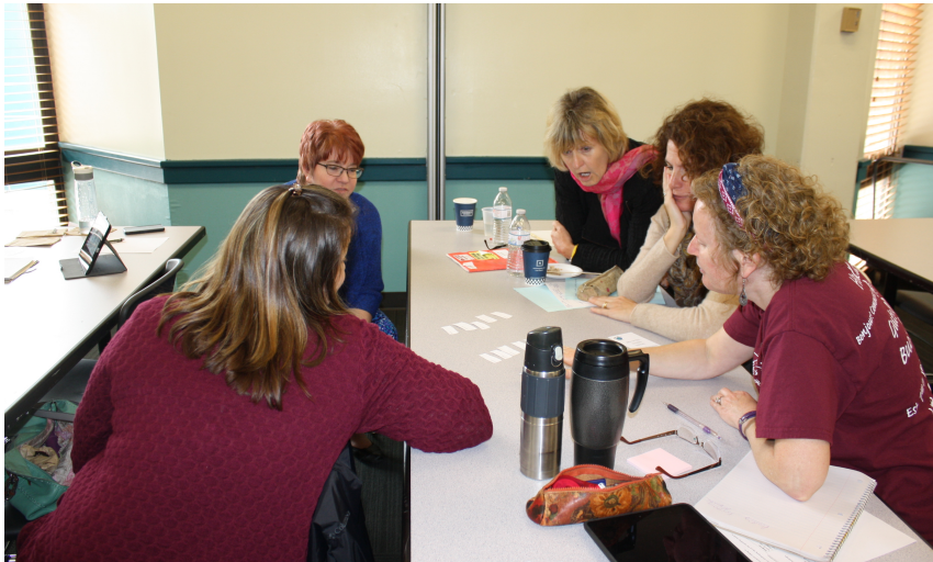
FLAGS Spring Workshop

The dates are July 19-24, so begin making plans now!