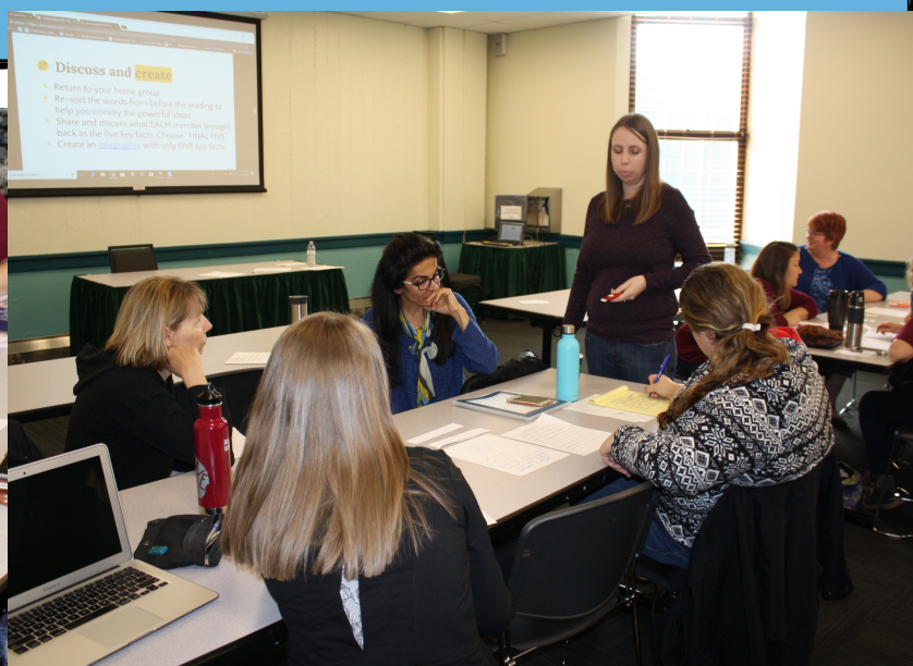
Highly engaged learners