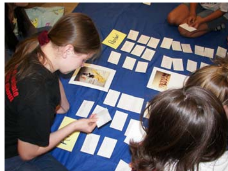
Bella Vista students preparing for the Francophone Africa museum exhibit.